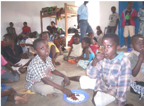
Lunch would be better with a cup of water