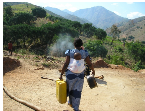
All water has to be carried by hand

to the Congo for Christ property. A filtering station and reservoir will also be constructed and will provide three distribution points on the compound. The cost for this water system is estimated to be $35,647.30. You may recall reading about the miracle of provision