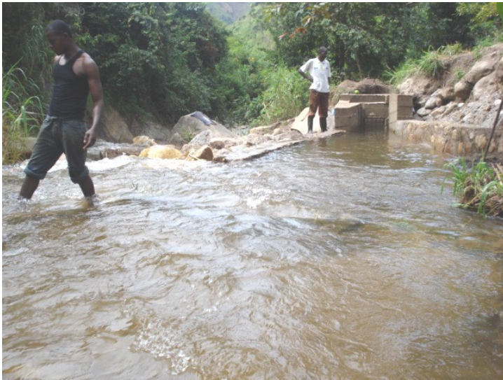
Water will come from the Mugaja river

Supplying water to the Congo for Christ campus has been a big challenge and an ongoing and expensive project. I am happy to report the work of constructing the pipeline, filter station, and reservoir is going well and is expected to be completed before the end of May. We extend our thanks to all of you who