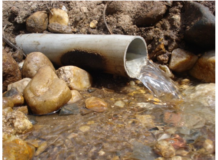
A portion of the 1.24 mile pipeline which will reach CFC

have made this project a reality. Many of you have been faithful partners for years, and many new friends of Global Outreach have contributed to this project through many creative fundraisers such as the Facebook Congo Water project, memorials for loved ones, sponsorships for a 10K race, selling t-shirts and the original "miracle" offering at National Community Church that set this whole project in motion. It is such a blessing to see it come together and know how it