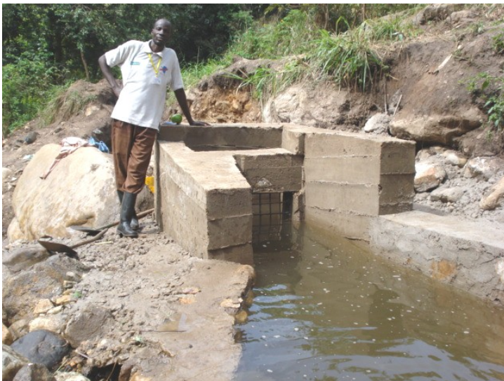
Water begins journey to Congo for Christ campus here

Supplying water to the Congo for Christ campus has been a big challenge and an ongoing and expensive project. I am happy to report the work of constructing the pipeline, filter station, and reservoir is going well and is expected to be completed before the end of May. We extend our thanks to all of you who