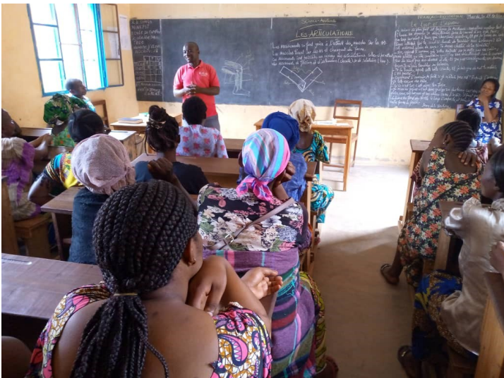
Widows are taught to open small businesses at Congo for Christ

This has been a difficult and challenging year for everyone, but even more so for our friends who struggle to provide even the most basic needs in the best of times. As the pandemic caused border closures and forced people out of work, the prices of food and other basic supplies increased drastically, causing a state of emergency for many of the ministries we support. As we shared these needs with you, your generous outpouring of love and support has allowed us to distribute more than $60,000 in relief efforts to Bangladesh, DR Congo, India, Myanmar and Vietnam. Thank you dear partners for your generosity during these trying times. Your gifts enabled us to help hundreds of people in extreme need. This has all been above and beyond the regular monthly support we send to children, teens, widows, Pastors and others that depend on us.