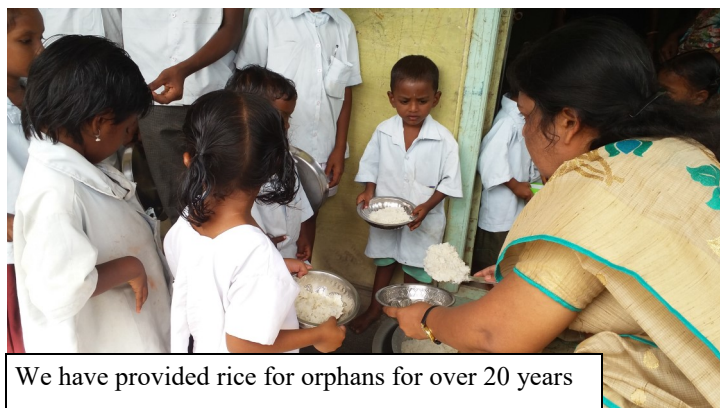
We have provided rice for orphans for over 20 years