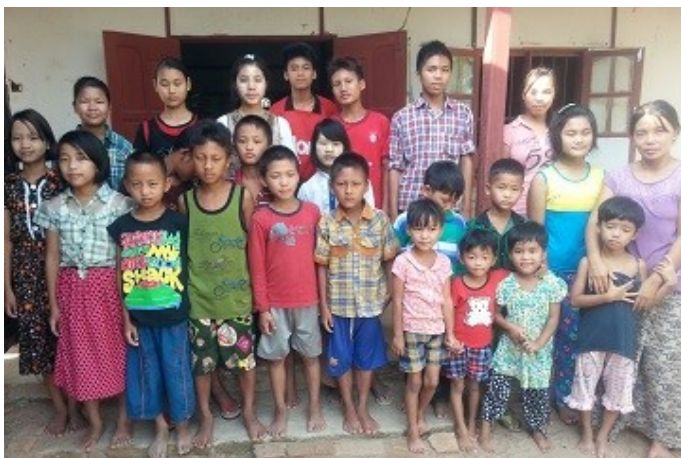
House of Refuge provides a loving home in Myanmar