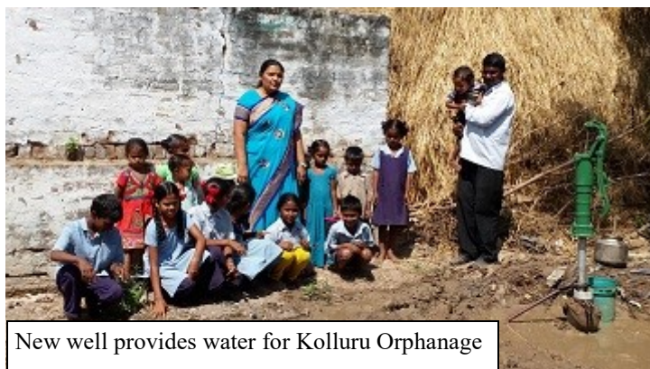
New well provides water for Kolluru Orphanage