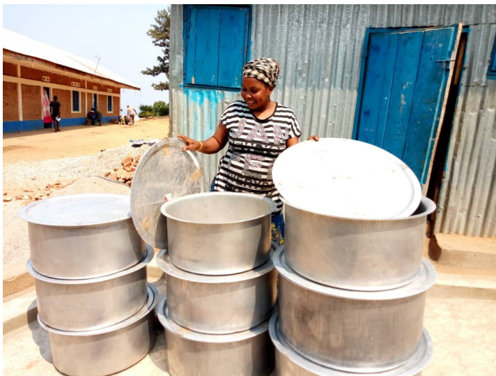
New cookware and a renovated kitchen are a big help

For several years now we have been aware of the need to build a chapel at CCC. We are thankful to report that a generous partner has provided the funding and construction has already begun. The new chapel will be large enough to seat 500 adults or 1,000 or