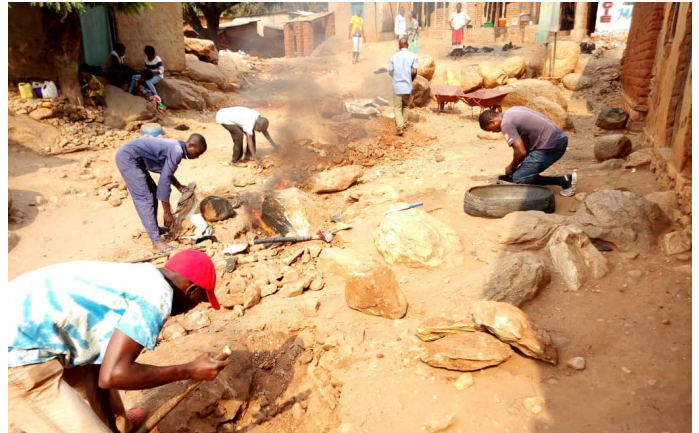
Difficult manual labor has resulted in a road which now makes CCC and MTS accessible to the new van.