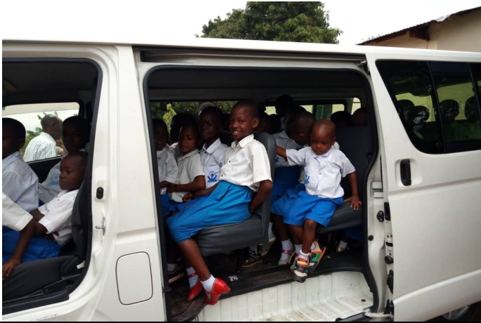
New van will help provide financial stability for MTS

nity. Hundreds of children who attend the feeding program have accepted Jesus as Savior and it is our desire that the new chapel will provide a Church for these children and their families. Even though the funding has been provided for the construction of the chapel there will be additional expenses not yet funded. The chapel will need seating, sound equipment, Bibles, hymnals and other necessary