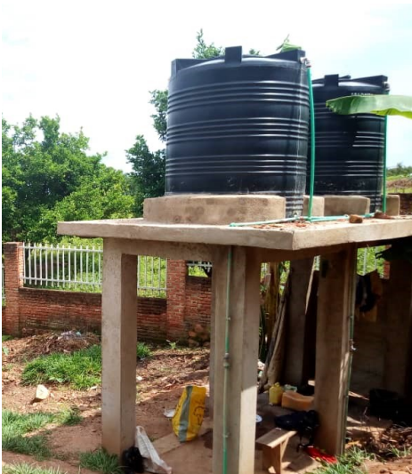
New water tanks for Mango Tree School

It has been another year of growth and impactful ministry at Congo for Christ Centre (CCC) in Uvira, Democratic Republic of Congo. In response to needs we shared with you in previous newsletters, we are happy to provide some updates. New water tanks for Mango Tree School as well as a new foundation for the existing water tanks