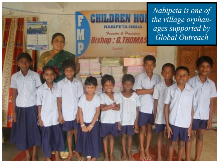
Nabipeta is one of the village orphanages supported by Global Outreach

The 110 orphans living in the village orphanages and the 179 orphans in the Tenali orphanage depend on the monthly support sent by Global Outreach partners. Your gifts have allowed these orphanages to raise hundreds of children in the love of Christ over the past twenty plus years.