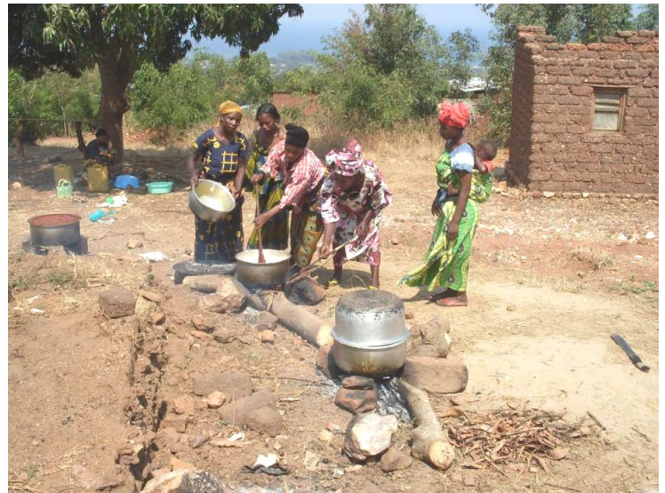
The current "kitchen" at Congo for Christ compound

We have received funds to pay for eleven of the needed mattresses. The mattresses cost $45.00 each, so we still need $1755 for the remaining thirty nine beds. In addition, two sheets and a blanket for each bed will cost $12.00 for a total of $600.