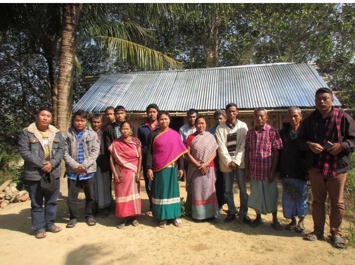
Dedication ceremony of new church in Murai

We have a new church planted at *Murai village. The entire village is Buddhist background and they are very strong in their belief. There are 30 families in this village. We visited and shared with them again and again about the Word of God but they don't want to listen and they rejected us. Through the help of the Holy Spirit we received 8 souls in our ministry, baptized four of them and trained new leaders. We will be following up with them in the coming months and continue to pray for the remaining people to also accept Christ as Savior.