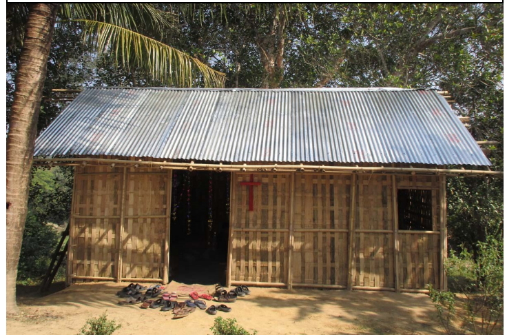
New church building constructed with bamboo from jungle

When a new church is established in one of the villages, the ministers and new believers begin to work towards construction of a church building. They gather wood and bamboo from the jungle to build the church. Samuel said it usually takes about five months for them to complete a new church. The only thing they have to buy is the tin for the roof. The tin costs about $1,500 for each church.