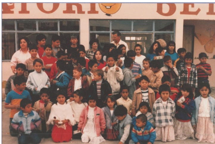
Bethel Orphanage, San Luis, Mexico —1987