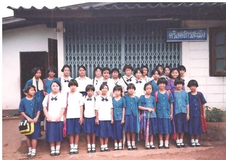
Sameong Children's Home, Chiang Mai, Thailand—1993