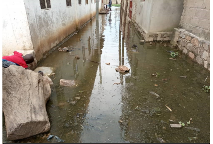
Kimanga church needs $3,815 to protect their property

Another urgent need is for the Kimanga church which is the mother church of Congo for