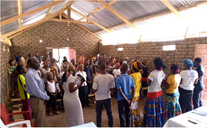
Baraka church has been dismantled and needs help to rebuild

this congregation of more than 100 members does not have any place to gather together for worship services. This past Sunday they met under a tree to hold a service, however, rain forced them to abandon that plan. They can rebuild their church on another temporary site at a cost of $3,203 or for $8,000 plus, depending on the size, they can purchase enough land to rebuild the church and have a permanent location.