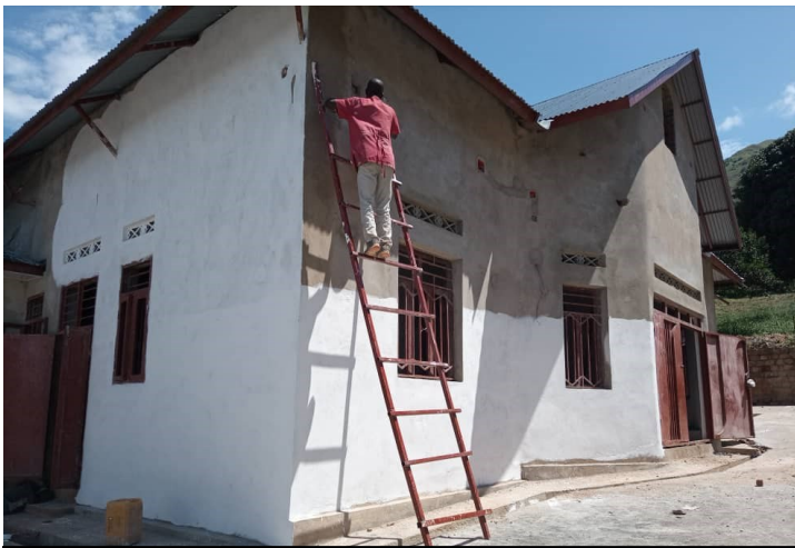
Painting and other finishing touches on the new chapel.

We are thankful to report that many good and encouraging reports have been received from Congo for Christ (CCC) in the past few months. Finishing work on the new chapel continues. They are now painting and adding windows and doors. They have been using the chapel for several months, but look forward to having it totally completed soon.