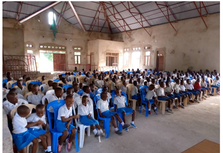
Mango Tree School students enjoy the new chapel!

is now fully funded. They have completed three of the phases and are now beginning the final two. A big thank you to all who contributed to this $51,802 project which was necessary to protect the property from flooding and water damage to the buildings.