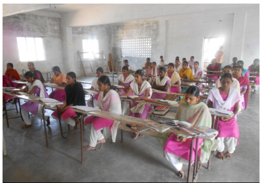
Teen girls study in medical classes

During our recent visit to India we had the privilege of visiting the medical college supported by Global Outreach.