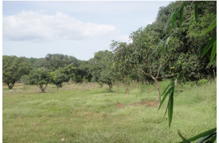
Property located about two hours north of Manila which will be the location of a new orphanage, Haven of Hope.