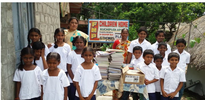
Fifteen orphans receive love and care at Kuchupudi Orphanage