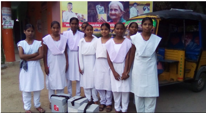
Medical students give vaccinations in local bus station

We're excited to announce that thirty-three teens recently graduated from the Bible School and Medical Vocational School in Tenali, India. A few of these young people will continue with more ad-