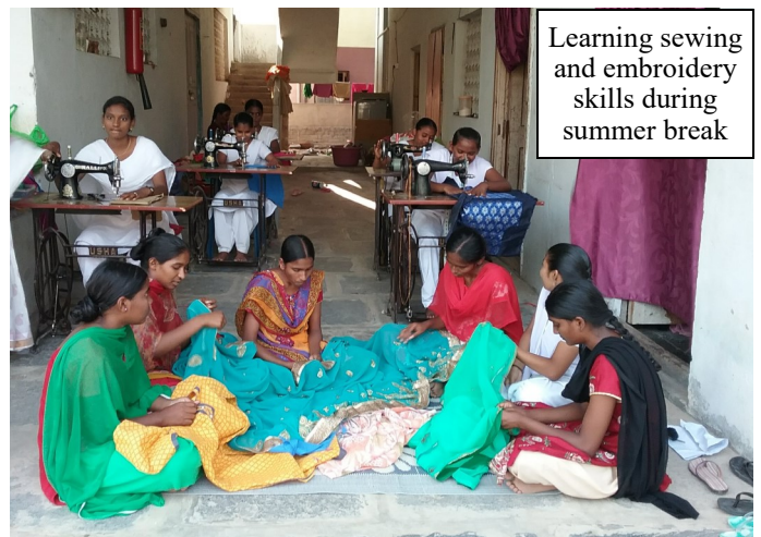
Learning sewing and embroidery skills during summer break

vanced medical training as funds become available. Most of them will be looking for jobs to employ their new skills in doctors offices, laboratories, and other medical clinics. Many of these are orphans who have been raised in one of the many Feed My People orphanages supported by Global Outreach. Some of the others are girls who have been rescued from working in brothels. During the summer break, the girls are learning other skills such as sewing and embroidery. Please pray for these teens to be successful in finding jobs. If you desire to fund additional training for one or more of these girls, you can designate your offering to the Allan and Harle Eliason Scholarship Fund.