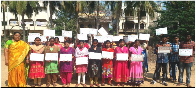
Graduates proudly display diplomas from Bible School and Medical Vocational School

We're excited to announce that thirty-three teens recently graduated from the Bible School and Medical Vocational School in Tenali, India. A few of these young people will continue with more ad-