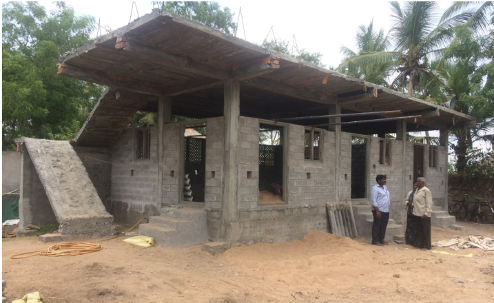
Work on the church is at a standstill until they can drill a well