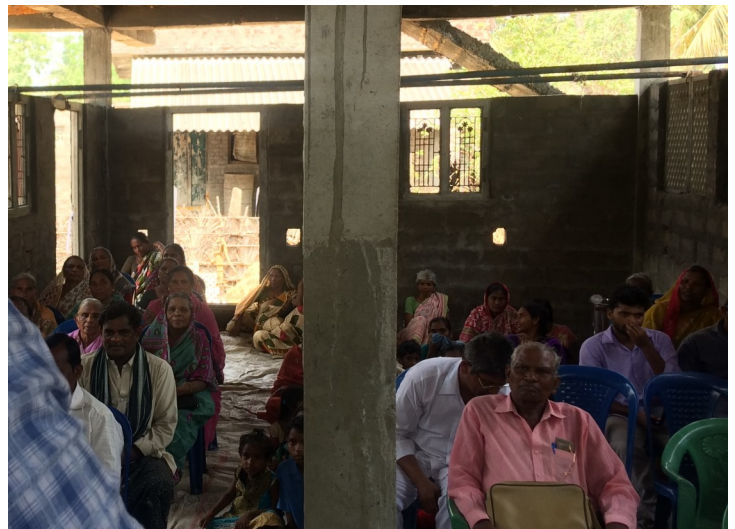
Worship services are held in unfinished church building

Many years ago a small thatched roof prayer hall was built. Since then forty people have committed their lives to Christ and became members of this local family of believers. Through the years they have had to endure much persecution by nonbelievers in the village. Also, the prayer hall has suffered repeated damage from storms during the rainy season.