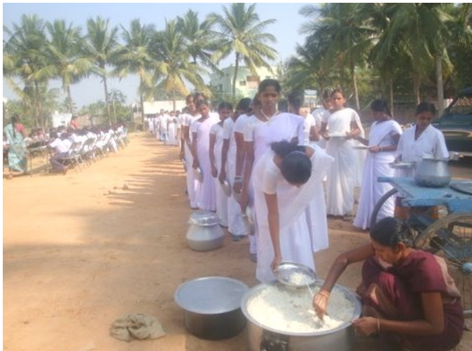
Teen girls enjoy Christmas dinner

Christmas is always a special time for our friends in India. Each year they look forward to a joyous celebration that includes a special dinner with chicken and ice cream. In addition to the new clothing for the orphans and teens, the pastors were given fabric to sew new clothing. Relief work included saris given to some of the elderly women and food and blankets to the poor and needy.