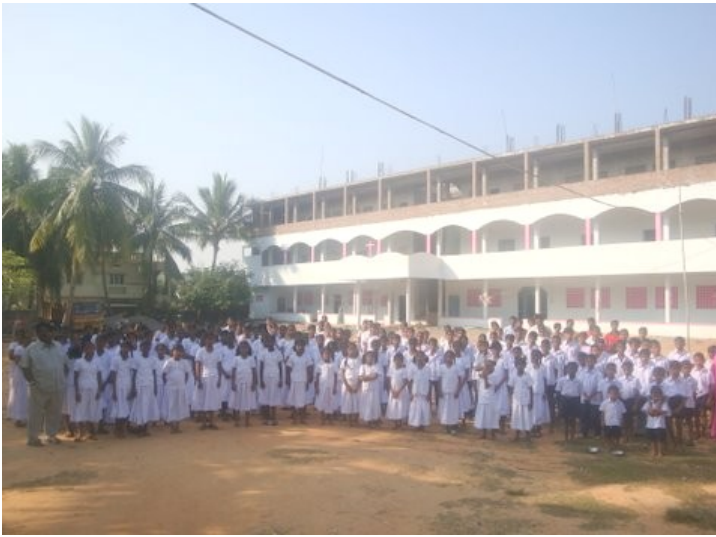
289 orphans received new uniforms for Christmas.

The third floor of the large building sponsored by Global Outreach in Tenali is nearly complete and will soon be put to good use as the teen girls are moved there from the old building where they currently reside. This building is now home to 179 orphans, an elementary school for the orphans, a Bible College and a Vocational Junior College.