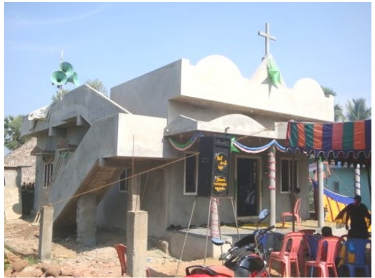
Dedication of new church building in Regulagunta

mocked and persecuted and warned to vacate this village...but we did not give up our vision...now we have more than fifty people in our church." This new building is a blessing to this village as well as a big help to Pastor Paul and the children who live in the nearby orphanage. They still need $700. to purchase windows and doors to complete the building.