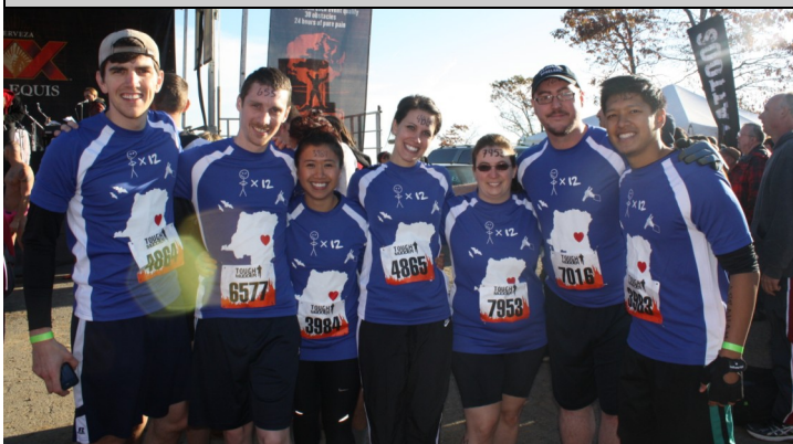
Brave team members are all smiles before the event begins

The rest of the team came out on a brisk fall morning to support and cheer them on, all wearing shirts that said "Toughin' it up for the Orphans in Eastern Congo". The Tough Mudder course was designed by British Special Forces to test all around strength, stamina, mental grit, and camaraderie. Some of the obstacles included swimming in an ice bath, scaling multiple walls, running through fire, crawling through mud, and running through wires charged with up to 10,000