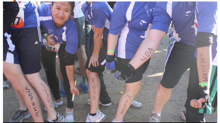
Names of orphans on their legs inspire team to "tough it out"