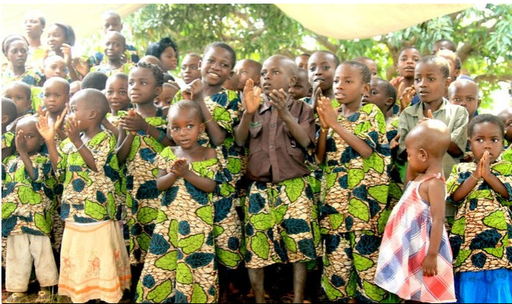
Team members have raised $2,895. for these orphans in Congo

On Sunday, October 23, seven of the thirteen members of the 2011 Congo Mission team from National Community Church set out to run a 25 obstacle, 9 1/2 mile Tough Mudder course for the amazing orphans supported by Global Outreach in Uvira, Congo.